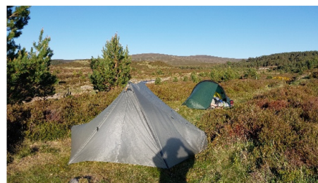
Example of one day from Route Information Guide